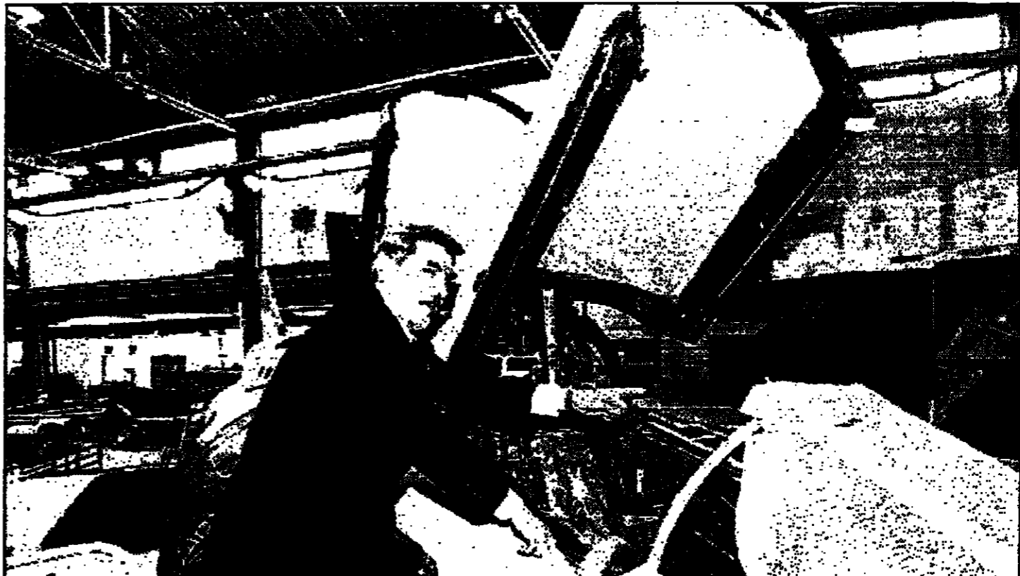
Turkish Defense Minister Turhan Tayan yesterday inspects one of the Turkish F-4 Phantoms being upgraded by Israel Aircraft Industries.

Tayan was received by a full military honor guard at the Defense Ministry, after which he